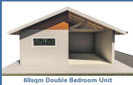
60sqm Double Bedroom Unit