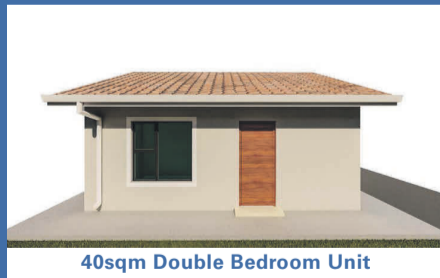
40sqm Double Bedroom Unit

Explore a variety of house plans, ranging from cozy 40 square meters to spacious 110 square meters. Find the perfect design that fits your family's needs and budget.