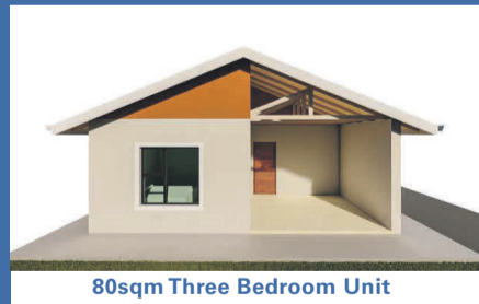
80sqm Three Bedroom Unit