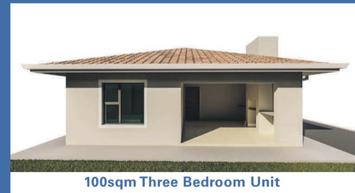
100sqm Three Bedroom Unit